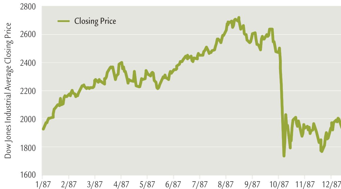
Dow Jones Industrial Average Daily Price Level, 1987

Source: Brandes Institute via Yahoo Finance, 3/31/2011. Past performance is not a guarantee of future results.